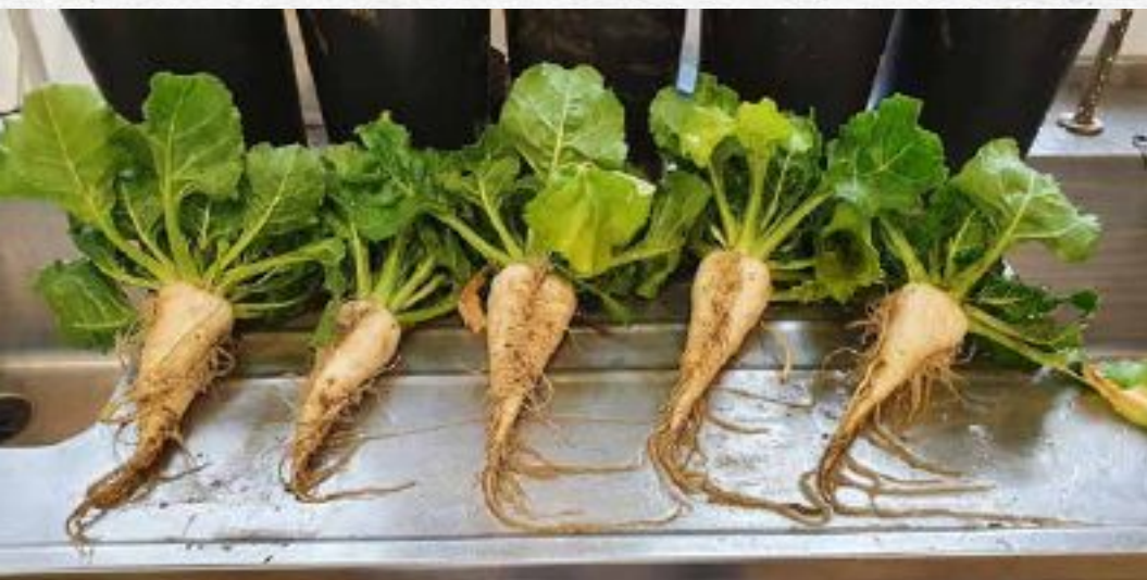
Fig. 3. Fibrous roots are important for the take up of water and nutrients

Milford (1973 & 1976) showed that sucrose concentration increases with cell volume but only up to a set size, per unit volume. As the storage cells in the parenchyma enlarge, they move away from the cambium ring and have less access to sucrose which results in a lower concentration of sugar compared to the small newly formed ring. This means that the larger the resulting in an overall lower sucrose Excessive N and low plant populations sugar concentrations and varieties can also have different sized root cells. The sized storage cells also has an important high levels of sucrose must be balanced out with other molecules such as sodium and potassium to ensure some water remains in the cell for biological processes to continue. This means that smaller storage cells have higher levels of impurities which is why reduced water availability increases impurity levels as cells shrink through loss of water the impurities increase. Disease and drought stress can also lead to a are remobilised to the shoots to provide the energy needed for leaf regrowth after premature leaf senescence.