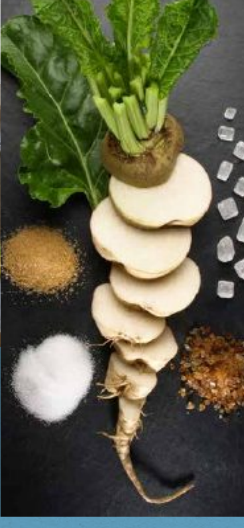
Fig.4. Cambium rings are visible throughout the storage root

Overall, the storage root is the part of the plant that is harvested but the accumulation of sugar in the storage root is only possible because of photosynthesis and sucrose production in the canopy. This is why sugar beet agronomy is focused on optimising canopy cover and health. This also relies on the network of fibrous roots that ensure water and nutrients are