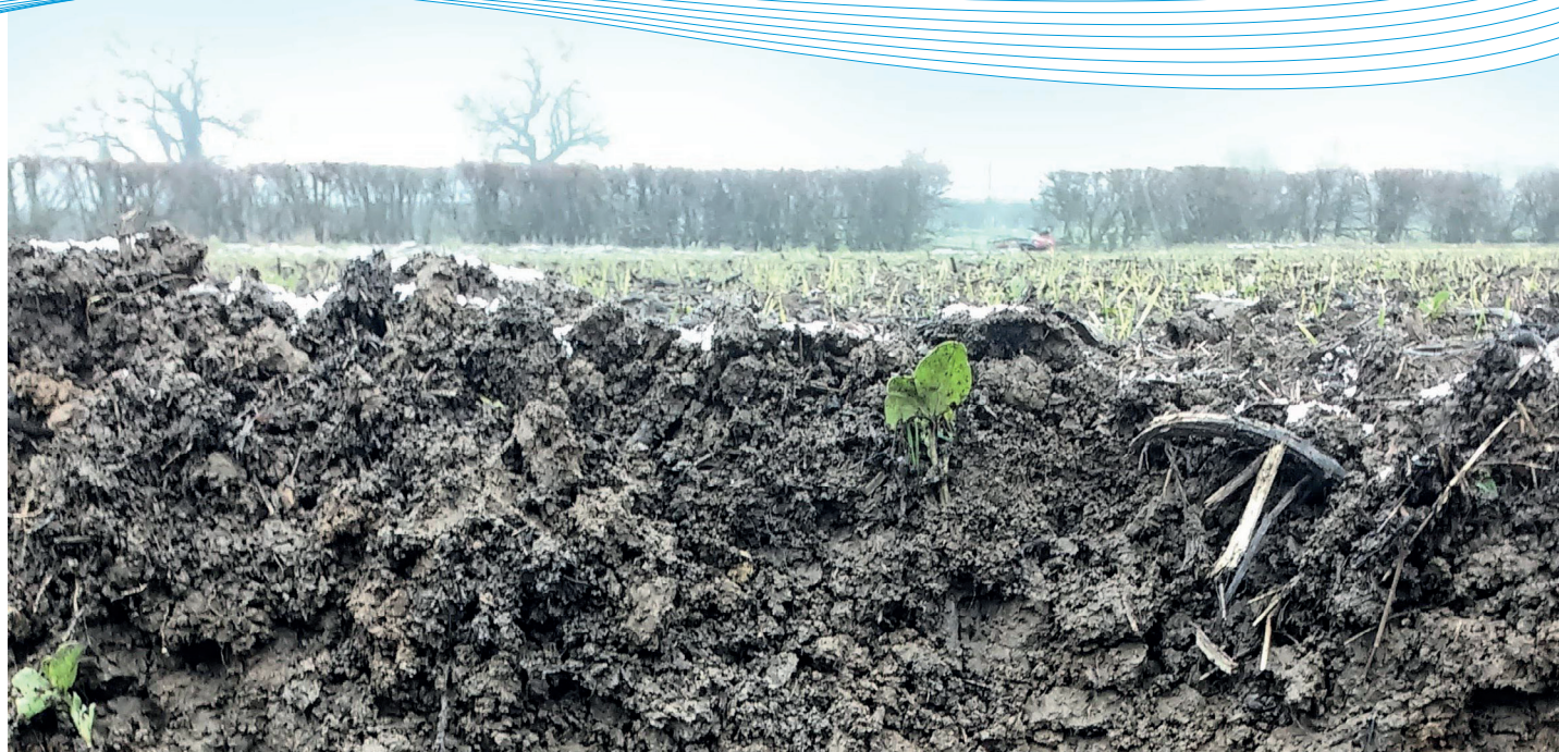
Figure 1. Well structured clay loam soil in an arable rotation with organic matter distributed throughout the topsoil