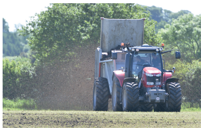
Figure 3. Muck spreader

Experience has shown that improvement in productivity in arable systems after improved organic matter management takes some time to appear. Defra research has shown measurable benefits of improved organic matter management, in addition to any nutrient supply benefits, but these are often only realised after at least six years of implementation. AHDB research suggests that farmers should first consider the nutrient value of any imported materials. Once these have been taken into account, it is rarely economic to spend more than a further £30 per tonne (dry matter) of organic materials added to soil per hectare (including the costs of material, haulage and spreading).