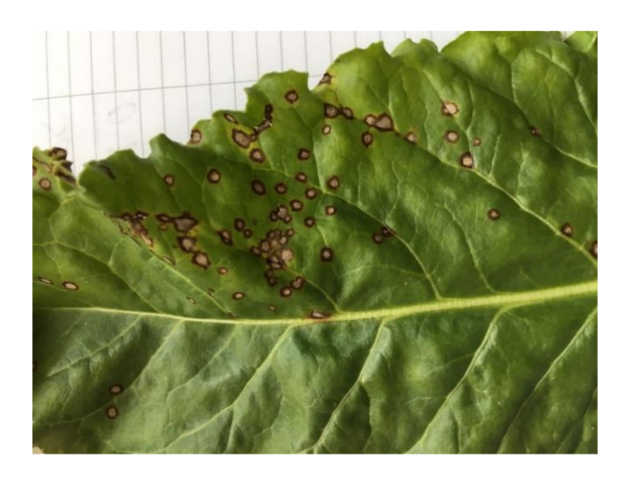
Confirmed case of cerospora in Norfolk

regular circular spots with necrotic, tan-grey centres and reddish-brown borders. If the disease develops unchecked, these spots can coalesce into larger brown necrotic areas on the leaf.