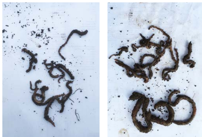
Figure 2. Example of earthworm populations from sites on medium soils with regular organic matter inputs (manures, crop residues) but contrasting tillage systems – conventional (left) and zero till (right) showing the beneficial effects of reduced tillage on the large deep-burrowing earthworm species

These scorecard data provoked interesting discussions in the farmer group about different management systems and their impact. Field A had higher SOM because of previous long-term inputs of farmyard manure and composts; the current field vegetable system now includes cover crops to try to maintain the SOM levels – the value of this added organic matter can still be seen in SOM and earthworm numbers. In Field B, potassium (K) has reduced under the mixed cutting/grazing management in the 3-year grass ley in this mixed system because of the high offtakes of K in silage. Field C had grown potatoes in 2017; the low earthworm numbers are probably because of the intensive cultivations associated with that crop.