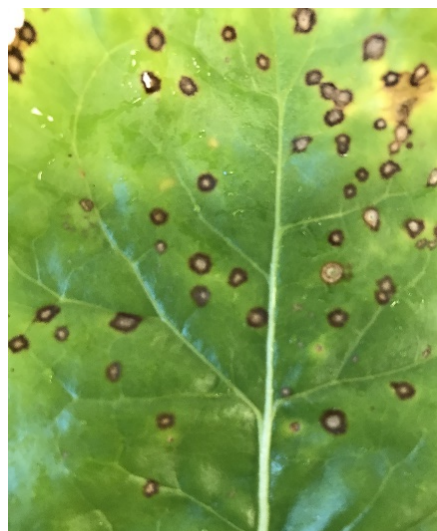
Fig 1: Established cercospora infection.

Apply fungicide after first symptoms but before infection is established.